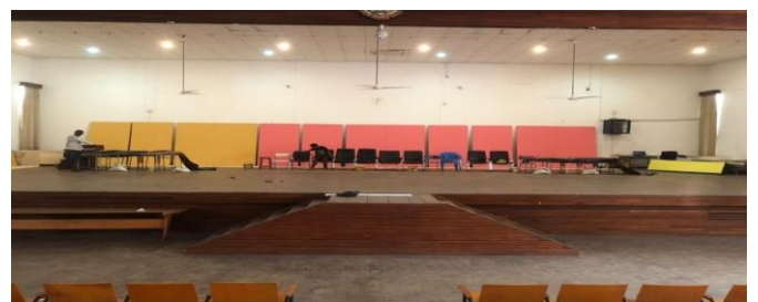
Fig 8: The stage of the UCC main auditorium

The Department of Theatre and Film Studies, situated within the Faculty of Arts, has adopted the auditorium as its laboratory and actively utilises the space for a spectrum of theatrical events, including rehearsals, workshops, and various performances. While the auditorium fulfils a vital role in hosting major university events, its adoption by the Department of Theatre and Film Studies further underscores its importance as a place for artistic and academic pursuits within the university community.