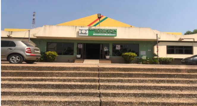
Fig 9: Front view of CNC, Cape Coast

The Centre for National Culture, is a cultural institution in Cape Coast, Ghana. It serves as a centre for the promotion and preservation of Ghanaian culture and traditions. The centre typically hosts various cultural events, exhibitions, and performances, showcasing traditional arts and crafts, music, dance, and other aspects of Ghana’s rich cultural heritage.