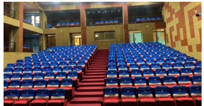
Fig 3: Main auditorium of SCA Theatre

Commissioned in 2018, the School of Creative Arts Theatre is an integral part of the John Agyekum Kuffour main building at the Central Campus of the University of Education, Winneba. The building encompasses offices, lecture halls, and various studios, providing a conducive environment for creative activities.