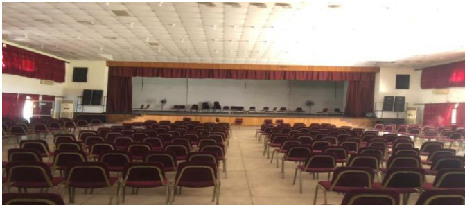
Fig 10: Interior view of CNC, Cape Coast