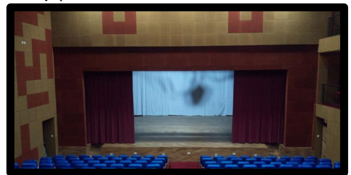
Fig 4: Stage of SCA Theatre

The theatre is equipped with basic staging facilities such as flying bars. The stage area, relatively spacious by design, can accommodate the diverse needs of staff and students’ productions. Notably, the auditorium boasts ample space above the stage area, allowing for some six flying bars that can be automatically and manually operated.