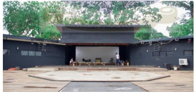
Fig 6: Interior shot of the Drama Studio

The proscenium has a height of 4.2 metres. Its depth from the proscenium arch to the back wall or cyclorama is 6.4 metres. The width of the proscenium from left to right is 10 metres. The proscenium covers an area of 286 square metres. From the proscenium arch to the end of the apron which marks the beginning of the arena is 4.5 metres. For stage illumination, the Studio makes use of wooden beams to rig lights on the proscenium and on the arena. (Obeng, 2014)