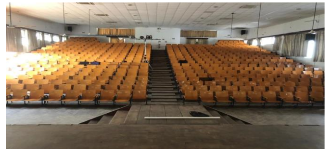
Fig 7: Interior shot of the UCC main auditorium

The University of Cape Coast Main Auditorium, can be found within the main Science Faculty building of the university. It serves as an important venue for significant university events. Despite its commendable large seating capacity, the auditorium is equipped with only basic sound speakers and lacks essential features such as lighting bars and other sophisticated stage facilities. This limitation in technical infrastructure may impact the versatility and overall production quality of events hosted in the auditorium.