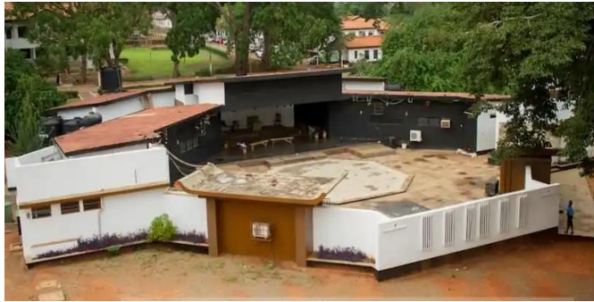
Fig 5: Aerial shot of the Drama Studio

Nestled within the academic enclave of the University of Ghana, the Efua Sutherland Drama Studio, popularly called the Drama Studio, stands as an iconic institution steeped in historical significance. Named after the renowned Ghanaian playwright, poet, and cultural activist Efua Sutherland, the Drama Studio holds a cherished place in the annals of Ghanaian theatre, having played a pivotal role in pioneering theatre education in the country. It stands as a tribute to Efua Sutherland’s vision of a vibrant cultural and educational space where creativity blossoms. As a centre for theatrical exploration, it caters to the academic and creative pursuits of the School of Performing Arts at the University of Ghana, purposefully designed as a versatile unit catering to research, workshops, and performances.