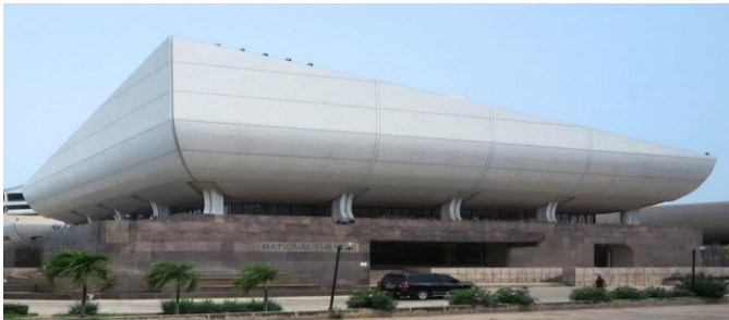
Fig 1: Exterior shot of the National Theatre of Ghana

The National Theatre of Ghana, inaugurated in 1992, serves as a central hub for the country’s theatrical arts scene. Its multifunctional facilities host a wide range of events, from concerts and plays to film screenings and exhibitions. The theatre is governed by a Board of Directors and managed by an Executive Director, overseeing various departments like Artistic, Technical, Marketing, and Finance. The architectural design of the National Theatre is a blend of Ghanaian heritage and contemporary artistic expression, featuring a curved roof reminiscent of a seagull in flight. The Main Auditorium, a 1,200-seat venue with a classic proscenium stage, is the centrepiece of the theatre, offering a traditional separation between performers and audience. In addition